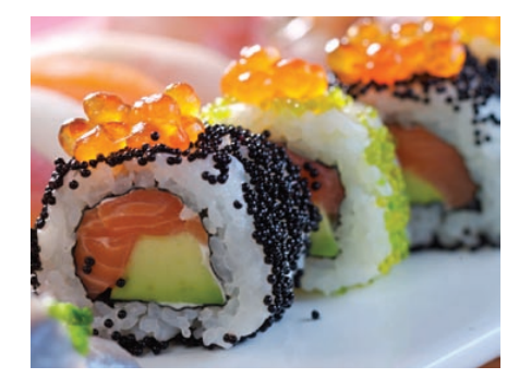
REMINDER There is more to preparing healthy foods than just cooking:

Be sure to read labels thoroughly to find added ingredients.